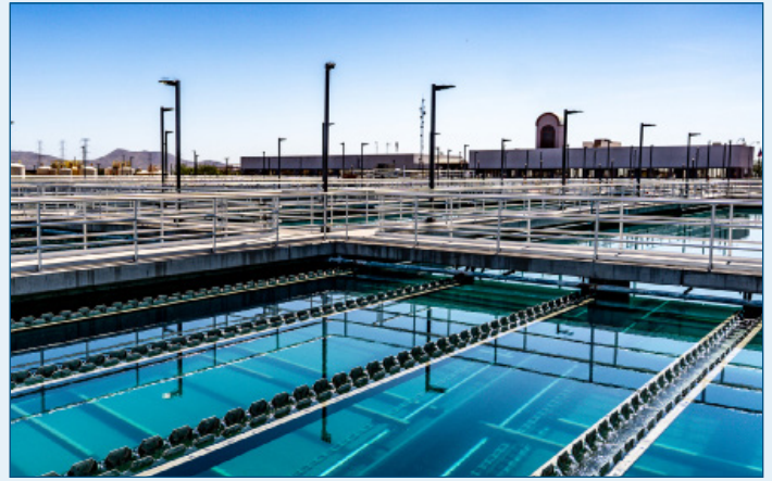
Water retention basins at the CAP plant at the Water Campus.

Scottsdale’s system-wide Automated Meter Infrastructure program is 78% complete, with more than 61,000 meters upgraded. Over 18,000 residents are now using the WaterSmart portal, and in 2025 alone, leak alerts