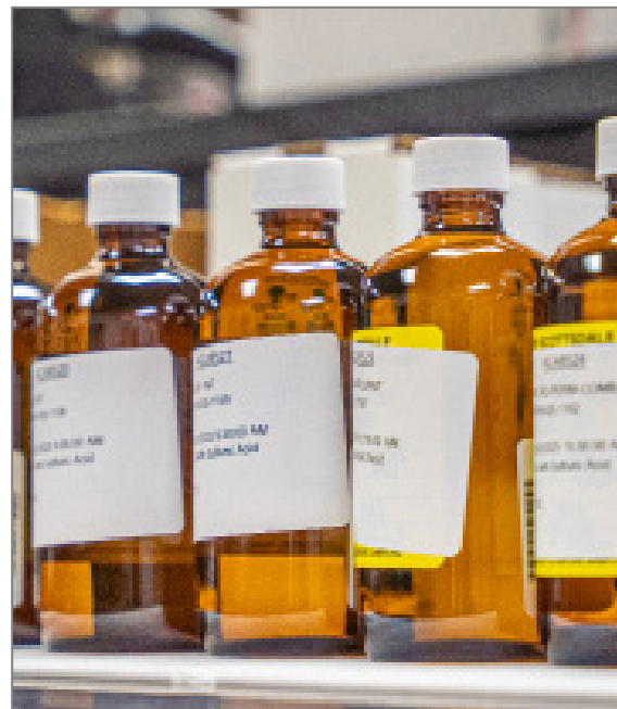
Scientists at the water quality lab test water from more than 150 locations monthly to ensure the safety of the water supply.