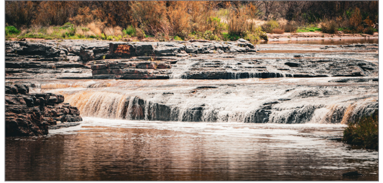
Water from the Salt and Verde rivers is delivered through the Salt River Project canal and treated at the Chaparral Water Treatment Plant.

Depending on the time of year, the weather and customer demand, you may receive water from a single source or from a combination of sources. 💧