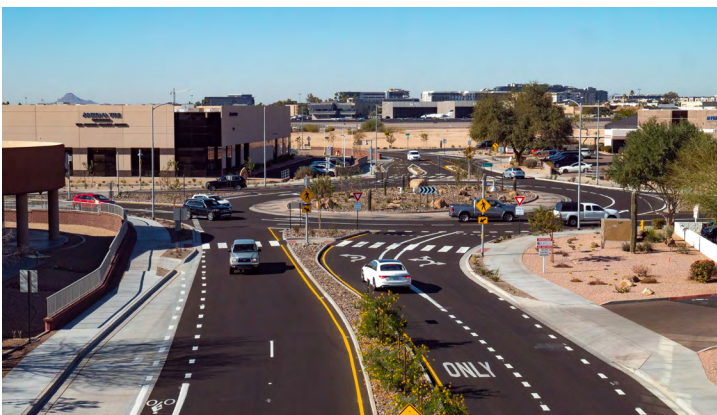
Roundabouts like this one along Raintree Drive Extension will provide a direct connection between the State Route Loop 101 Freeway and Scottsdale Road.

Projects on Pima Road, Happy Valley Road, Miller Road, and Raintree Drive add an additional eight miles of travel lanes and four roundabouts to improve safety and reduce traffic congestion.