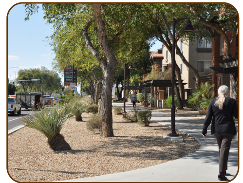
Pedestrian Supportive – Indian School Road includes wide sidewalks separated from traffic and shade trees. Bicycles are accommodated in an on-street bike lane.

Pedestrian Supportive – Street environments within Old Town that are inviting to pedestrians. Land uses in these areas are commonly mixed with active, ground-level uses, where buildings are oriented to the pedestrian realm. These areas typically provide shade by way of trees, awnings, or arcades. Roadways within these areas include moderate traffic speeds, where intersections give priority to pedestrians. The pedestrian realm within these areas include sidewalks that are separated from vehicular traffic and are wide enough to accommodate increased levels of use.