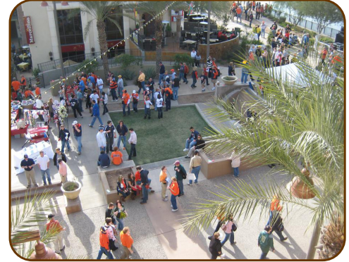
Open space designed to encourage pedestrian activity.