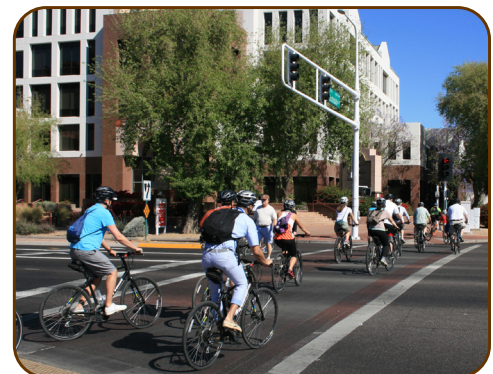
Complete streets allow for use by pedestrians, bicyclists and vehicular traffic.

“Downtown should always be pedestrian friendly.” ~ Deciding the Future Workshop Participant, 2008