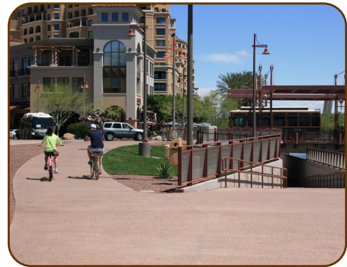
Providing a variety of transportation modes throughout downtown allows people to circulate, whether by biking, walking or driving.