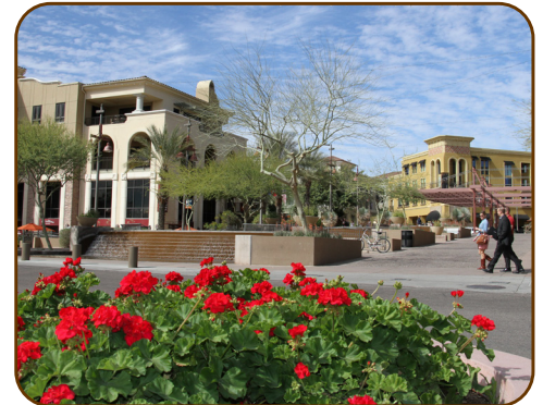
Pedestrian Place – The Marshall Way Bridge and Southbridge area have wide sidewalks, outdoor dining, traffic moving at low speeds, and frequent crossing opportunities.

Pedestrian Place – Street environments and publicly-accessible spaces within Old Town that are the most inviting to pedestrians. Adjacent land uses within these areas typically include active, ground-level uses, where buildings embrace the pedestrian realm. These areas include ample shade, which is provided by way of wide awnings, trees, and arcades. Roadways within these areas include low traffic speeds, where pedestrian crossing opportunities are frequent and oftentimes on-street parking buffers the pedestrian. The pedestrian realm within these areas includes sidewalks that are separated from vehicular traffic and are wide enough to accommodate the highest levels of use, including formal and informal gathering spaces and other pedestrian amenities.