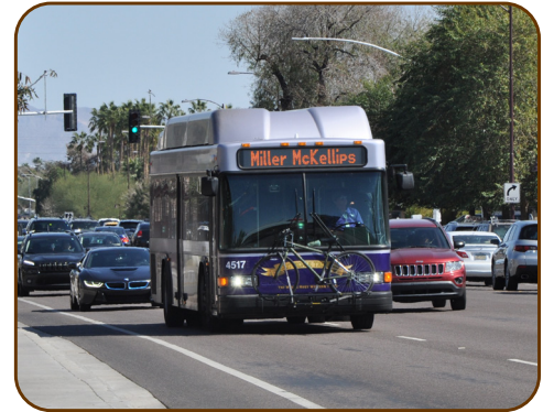
Transit connections in Old Town and Southern Scottsdale are enabled by the trolley system.

“Downtown should always be pedestrian friendly.” ~ Deciding the Future Workshop Participant, 2008