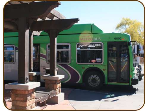
Transit stop within Old Town provides regional connectivity.