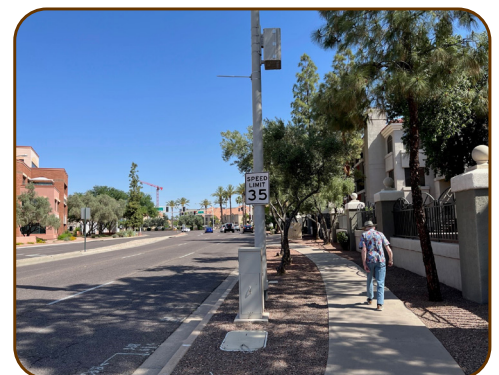
Pedestrian Compatible – Drinkwater Boulevard accommodates the pedestrian with landscape-separated sidewalks that include trees for shade.

Pedestrian Compatible – Street environments within Old Town that accommodate pedestrians. Adjacent land uses within these areas often include mixed-use and single-use buildings that may not actively engage the pedestrian realm, yet still provide shade by way of landscaping and trees to enhance the streetscape. Roadways within these areas include the highest traffic volumes at moderate speeds, where pedestrian crossings are designated. The pedestrian realm within these areas include sidewalks that may be separated or adjacent to vehicular traffic and developed at minimum widths.