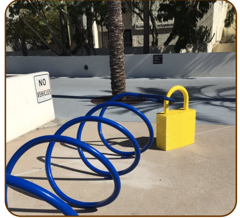
Bicycle infrastructure encourages bicycle use in Old Town.

Incorporate safety measures at grade separations, street crossings, and intersections to minimize conflicts with vehicles, pedestrians, and other bicyclists.