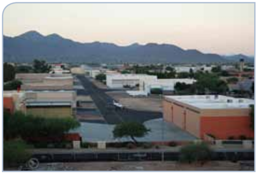
A unique aspect of the Greater Airpark is private property access to taxilanes, also known as "through the fence operations".

Promote Airport and aviation heritage through aviation-related street naming, special monuments, and other unique features to enhance the Greater Airpark's identity.