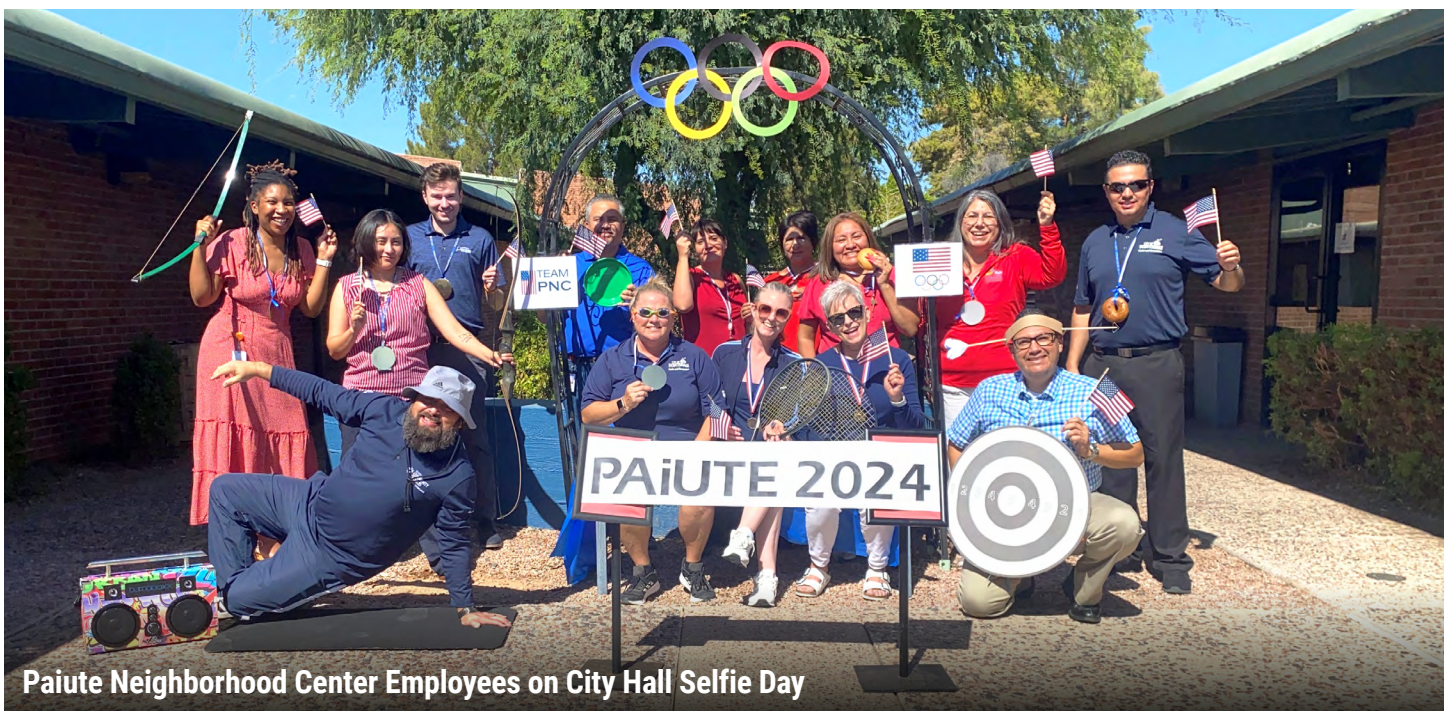
Paiute Neighborhood Center Employees on City Hall Selfie Day