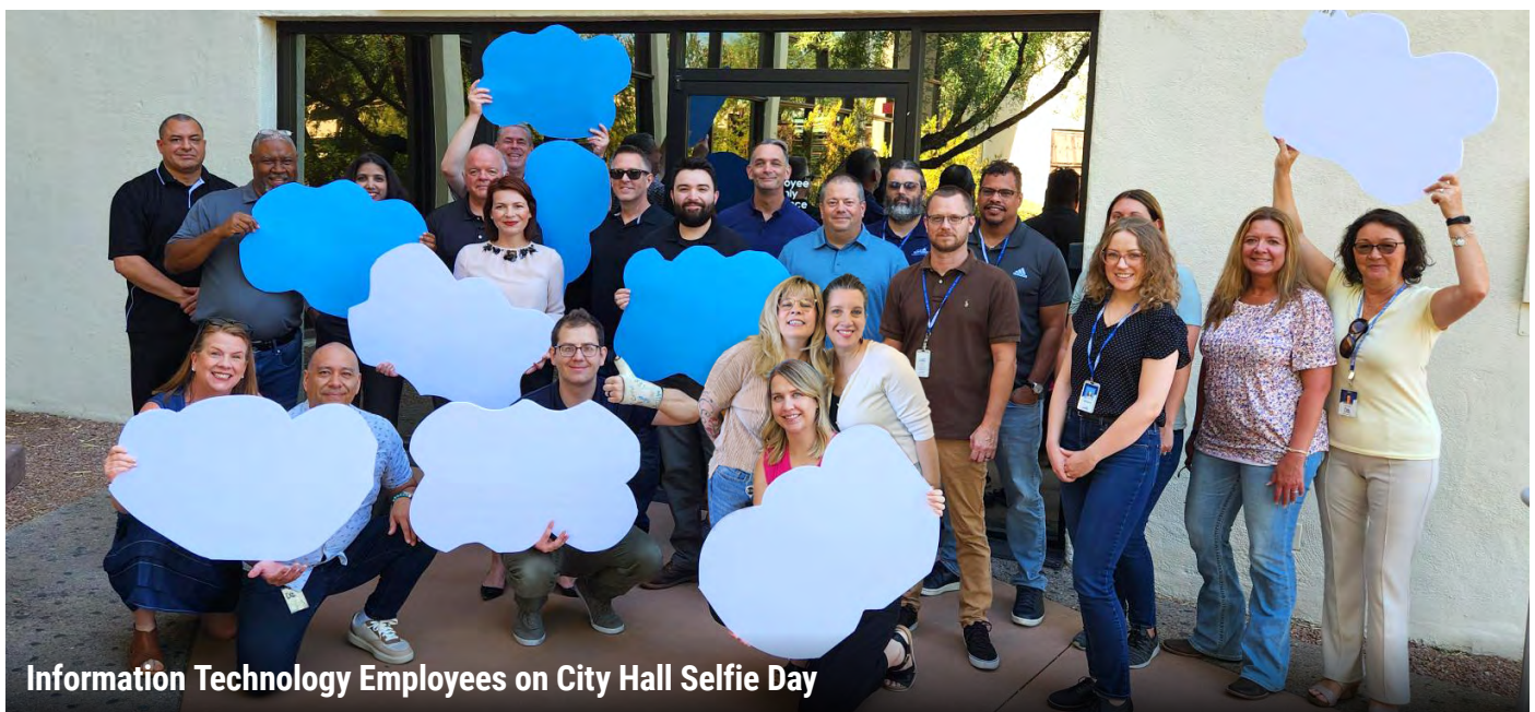
Information Technology Employees on City Hall Selfie Day