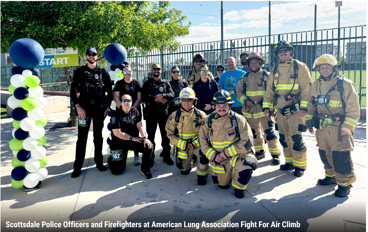
Scottsdale Police Officers and Firefighters at American Lung Association Fight For Air Climb