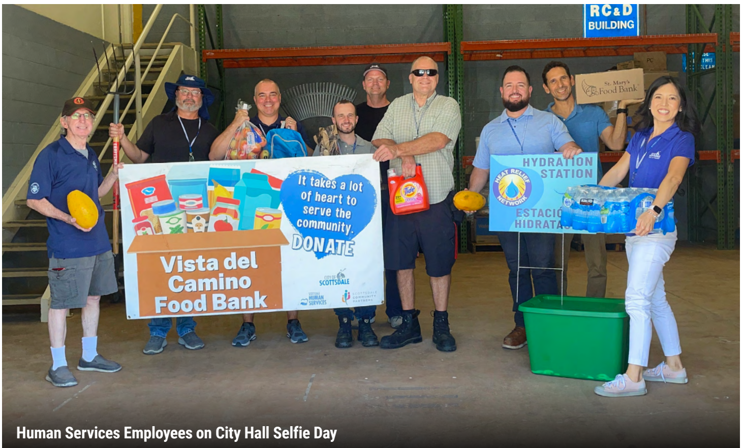
Human Services Employees on City Hall Selfie Day

Visit the MotivateMe incentive page on myCigna.com for more ways you can earn with your 457 account.