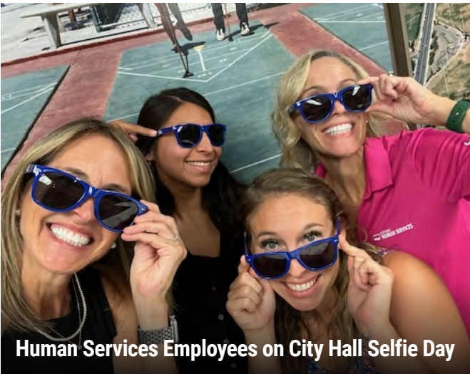
Human Services Employees on City Hall Selfie Day

*For those enrolled in the HSA plan, most prescriptions will apply to the deductible first.