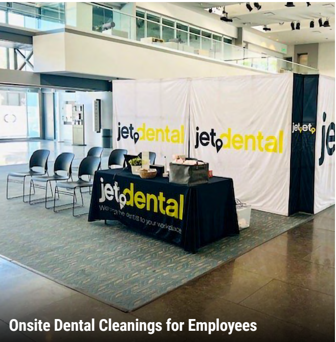
Onsite Dental Cleanings for Employees

* Maximum city contribution is $1,000 per family if both spouses are city employees.