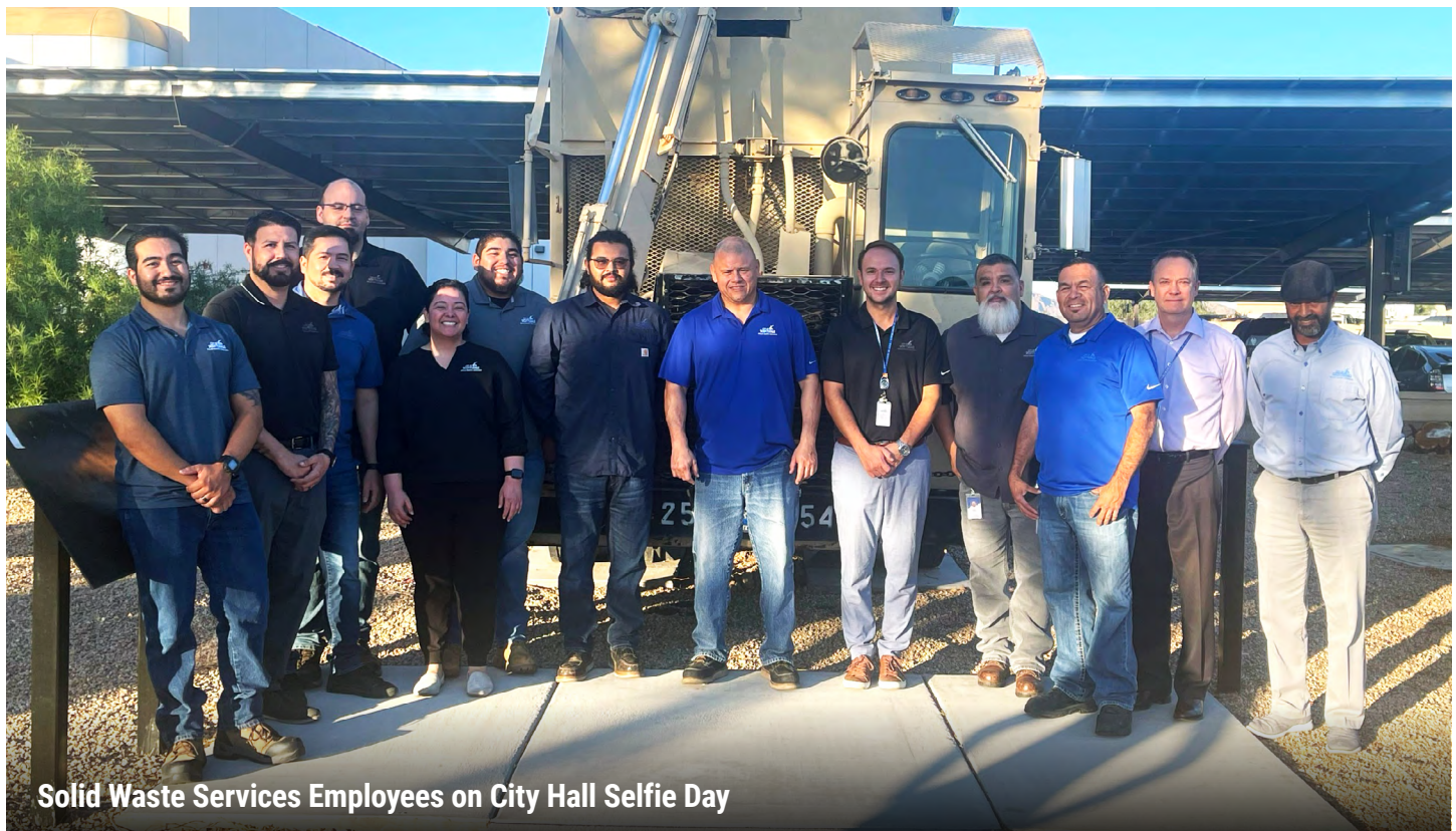
Solid Waste Services Employees on City Hall Selfie Day

*Members who receive a preventive cleaning will have their annual maximum benefit increase by $200 the following plan year.