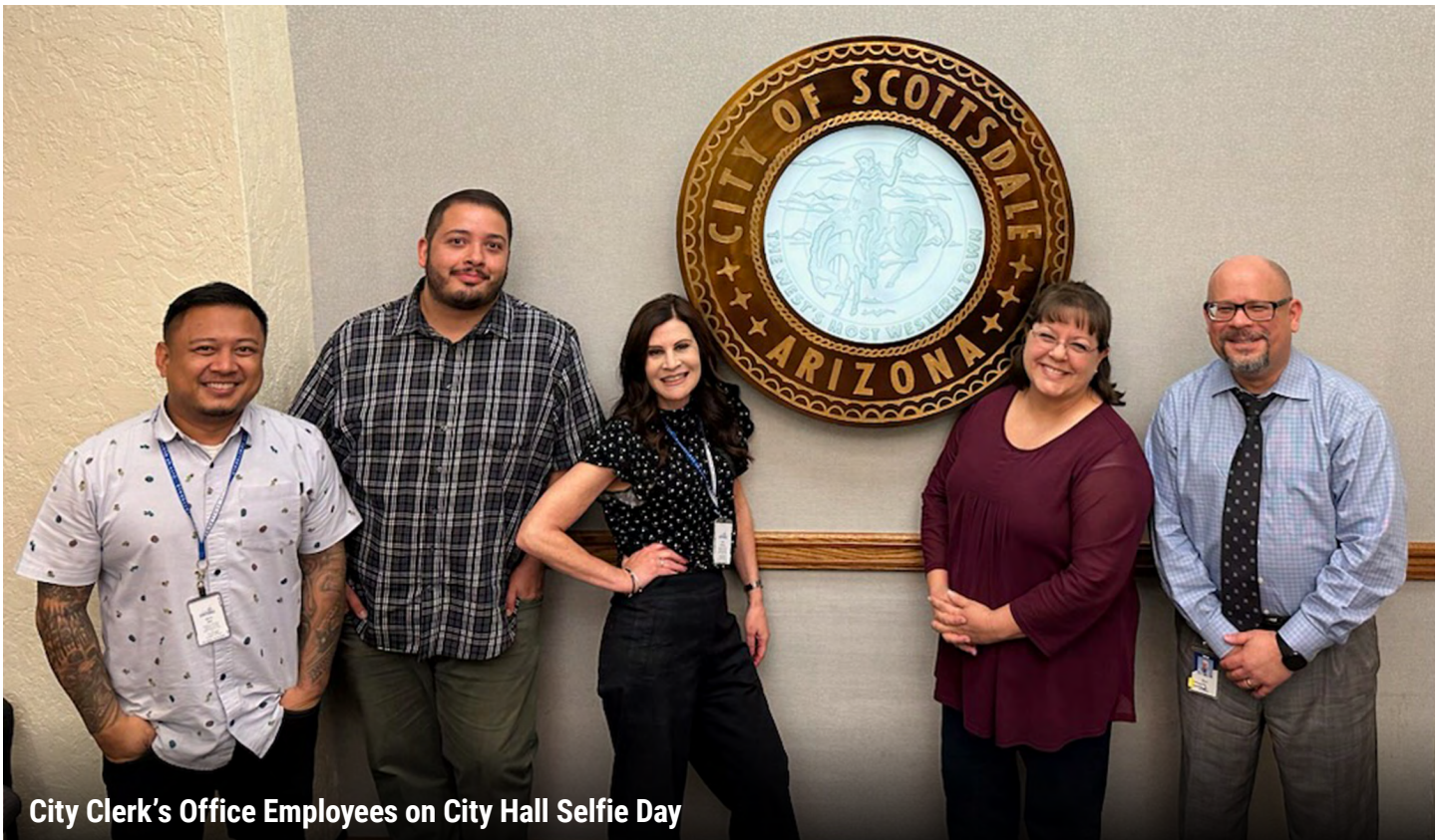
City Clerk's Office Employees on City Hall Selfie Day

Note: You must purchase additional life insurance on yourself to be eligible to purchase coverage for your spouse and/or your children. Coverage is subject to the approval of NY Life Insurance. You may apply for new or increased coverage at any time, but you must satisfy NY Life Insurance's insurability requirement.