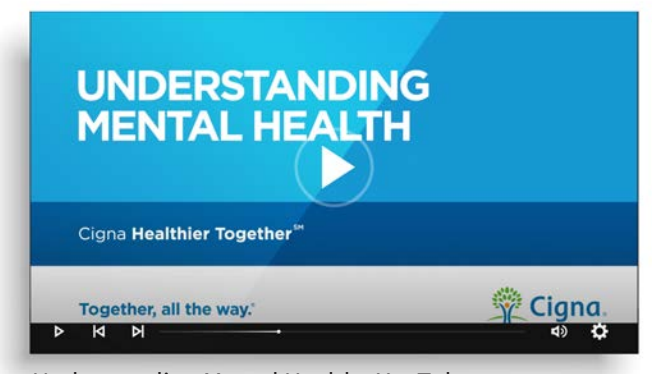
Understanding Mental Health - YouTube