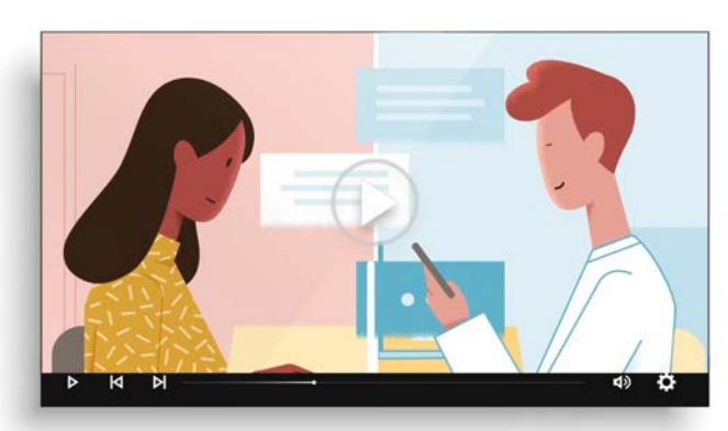
Learn more about how Ginger works by watching this video