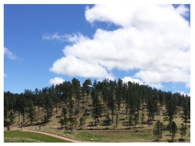
"Water-Tower Hill" - The site of the up-hill sprints.

Upon return to station, the remainder of the crew reconfigured and lined-out in "tool-order" to continue PT. It was noted that during this brief lull in activity, the employee who would eventually be diagnosed with Rhabdomyolysis made the comment "It'd be nice to have some water...", to which another within ear-shot replied "yeah... I know". The "long, slow run" was followed by three rounds of relatively short uphill sprints interrupted by a "loop-run" within sight of the hot-shot base. This event lasted roughly forty-five minutes.