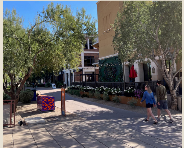
Shaded pedestrian path along Arizona Canal.

Together, these components create a complete decision-making framework, from planning and design to construction and long-term management. The map and street prescriptions illustrate where each tree type should occur, while the guidelines describe how those trees should be planted, sustained, and integrated with the surrounding built form. When used collectively, they ensure that tree selection, placement, and performance advance consistent, measurable outcomes for shade and identity across Scottsdale's downtown.