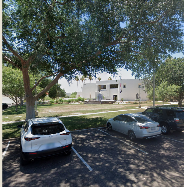
Consistent canopy coverage in parking areas can reduce heat gain.