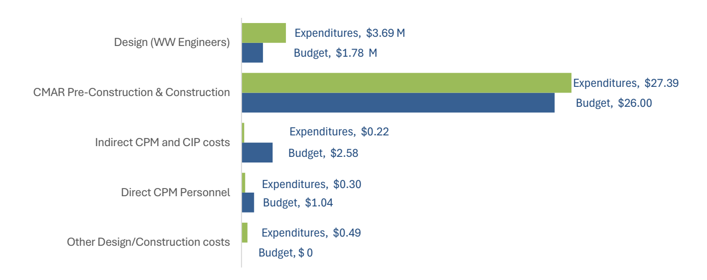
Figure 4. Budgeted and Final Project Costs.

expenditures exceeded budgeted amounts by about $700,000. This overage was funded by another Water Resources capital project.