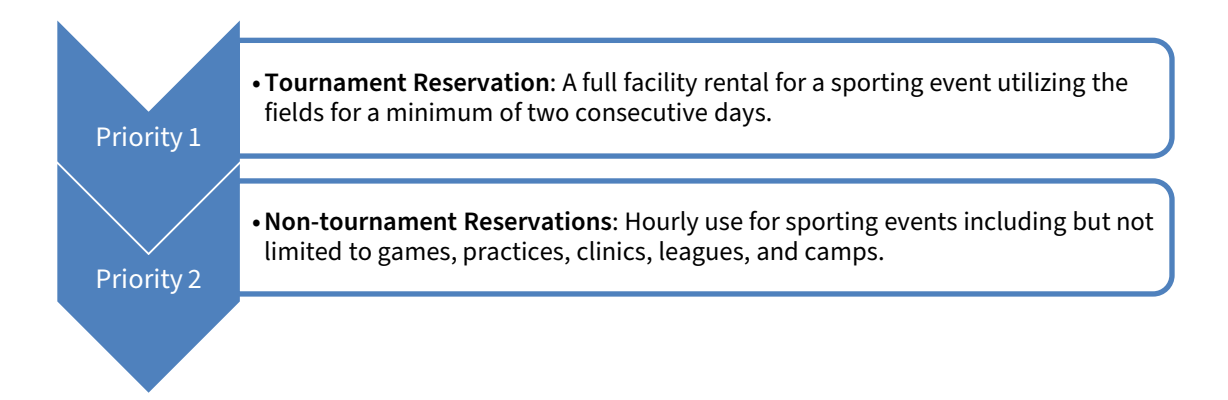
Figure 4. Scottsdale Sports Complex Priorities