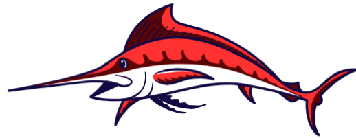
MCDOWELL MOUNTAIN MARLINS