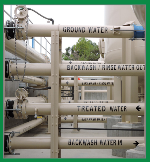
The NGTF helps Scottsdale ensure that previously contaminated groundwater is cleaned and put to local beneficial use.