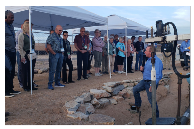
For more information, visit ScottsdaleAZ.gov and search "Water Academy."

The Scottsdale Water Citizen Academy provides an inside look at your city's water utility, which happens to be one of the most advanced municipal water systems in the country! The multiweek course explains all facets of Scottsdale Water planning and policies and takes you inside our state-of-the-art facilities and daily operations.