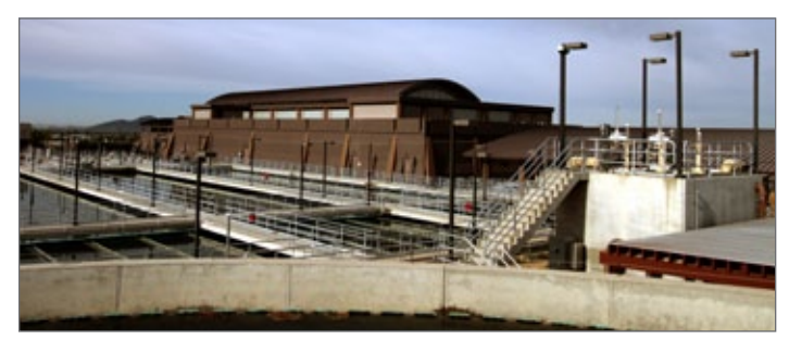
Scottsdale's CAP Water Treatment Plant