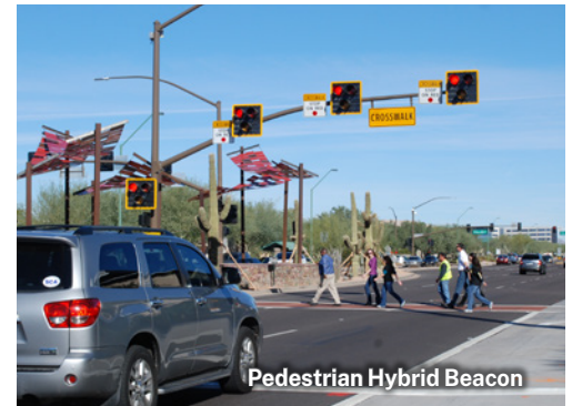
Pedestrian Hybrid Beacon

The McDowell Sonoran Mountain Preserve had 893,000 visits .