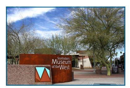
11. Scottsdale's Museum of the West