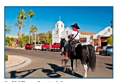
9. Old Town Scottsdale