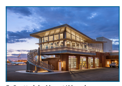
5. Scottsdale Airport/Airpark