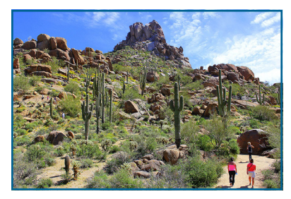
1. Pinnacle Peak Park