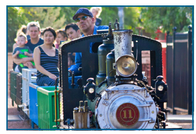
6. McCormick-Stillman Railroad Park