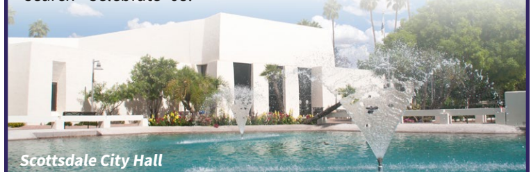
Scottsdale City Hall

In addition to the family fun Oct. 13, a handful of other Celebrate ‘68 activities will occur in the prior week. Find the latest information and event schedule at ScottsdaleAZ.gov , search “Celebrate ‘68.”