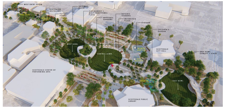
A concept view of Civic Center’s redesign from the southeast.

A picturesque botanical garden, sculptural play elements and a new interactive water and fog plaza are just a handful of the new elements proposed for Scottsdale Civic Center’s enhancement.