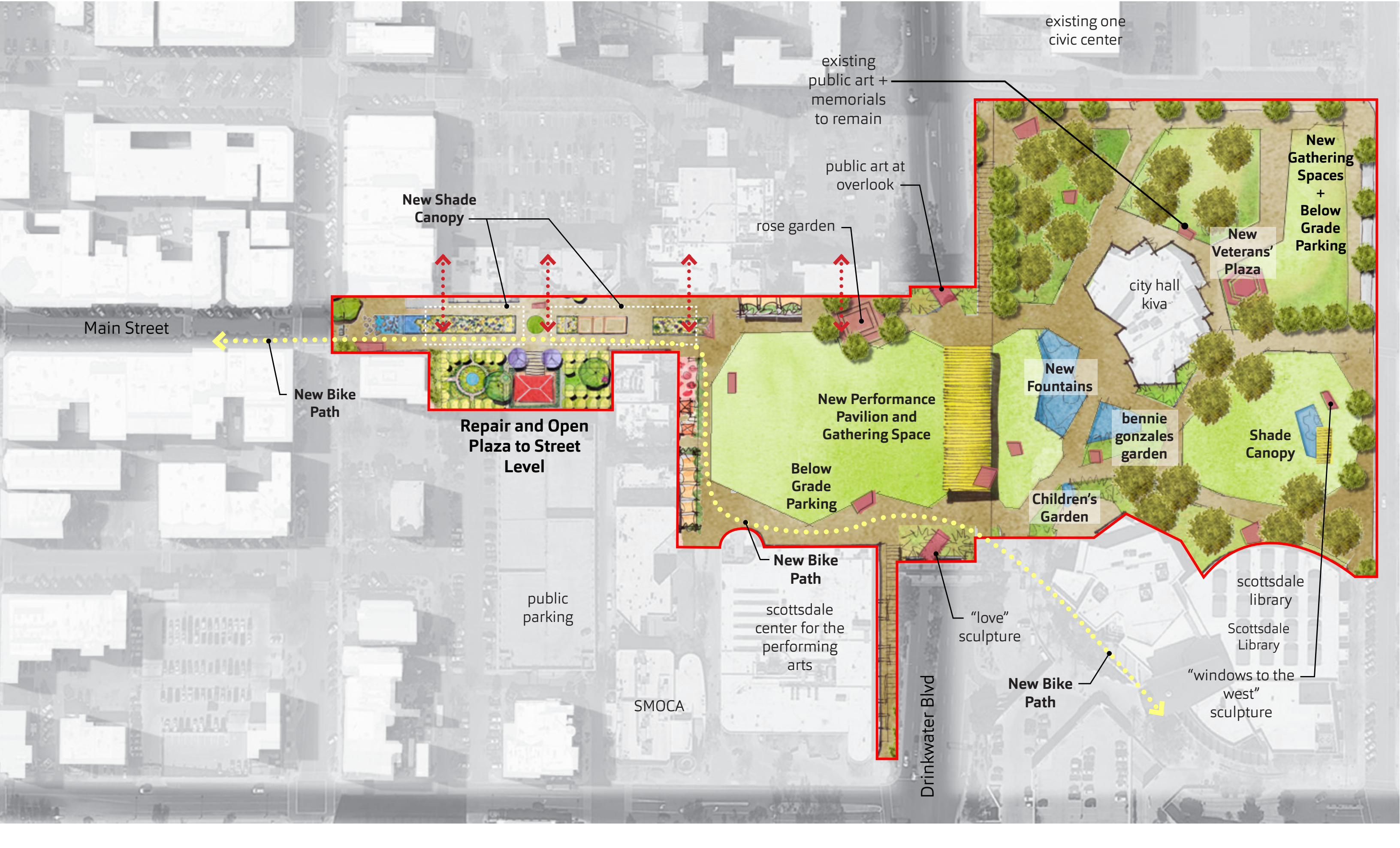
MUMSP PROJECT AREA