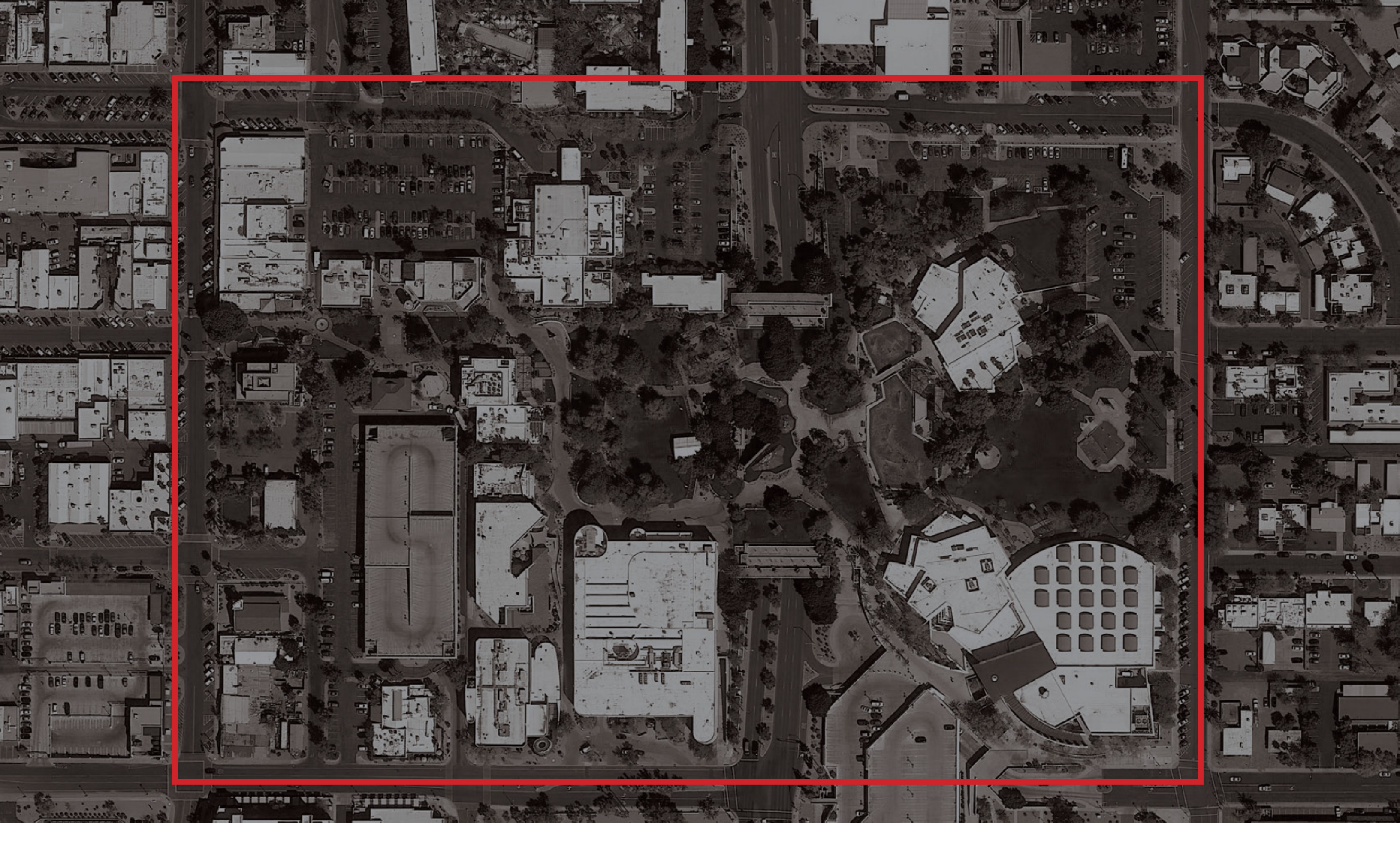
CIVIC CENTER: EXISTING AERIAL VIEW