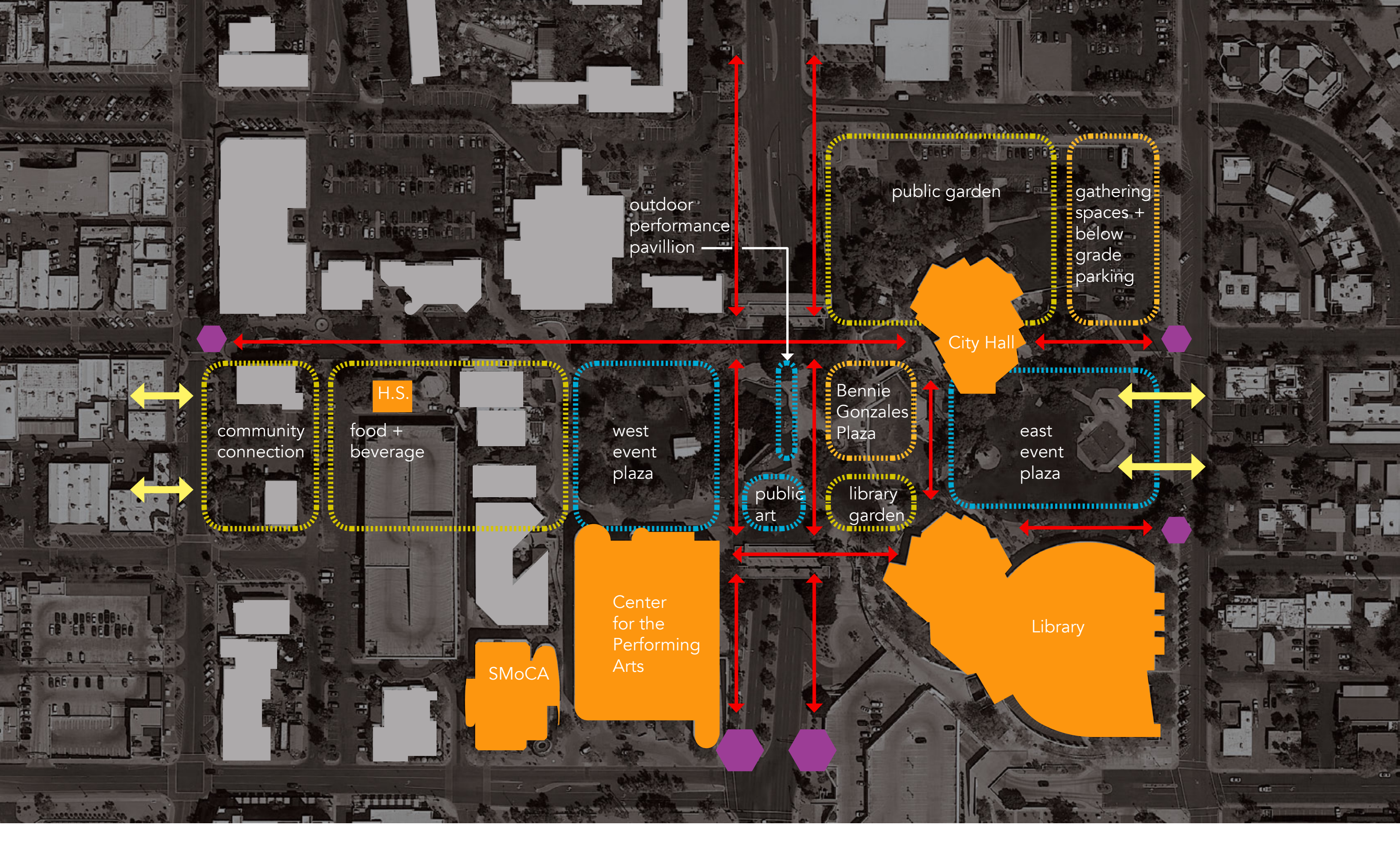
CIVIC CENTER: USE DIAGRAM