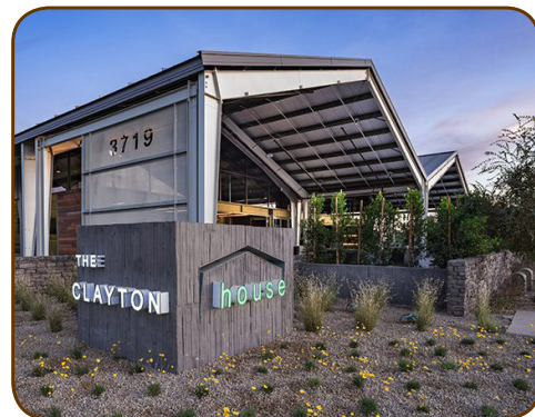
High quality design through adaptive reuse as seen in the Clayton House, a special events venue.

"Pay attention to craftsmanship and quality to create authenticity." ~ Focus Group Participant, 2007