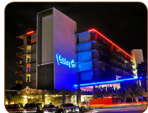
Hotel Valley Ho, Circa 2013

As one of Scottsdale's early resort hotels, the revitalization and expansion of the historic Valley Ho is a good example of a public /private partnership, innovative zoning practices and a demonstration of the community value to protect its historic resources and unique character.