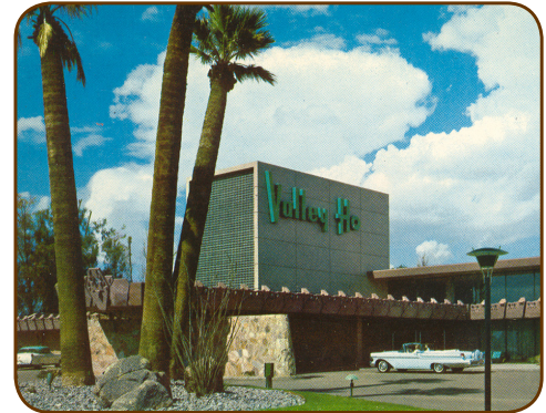
Historic Valley Ho, Circa 1956