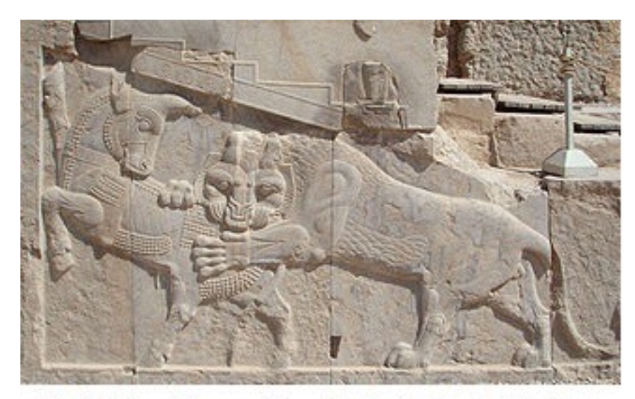
A relief from Persepolis metaphorically depicts the Spring Equinox in the form of a bull (the Earth) and lion (the Sun) fighting. Neither is stronger than the other.

A time of clearing mind, cleaning house, renew wardrobe, refresh and celebrate the nature as spring begins with fresh flowers and budding new life. This ancient holiday is called Norooz (sometimes spelled Norouz, Nawruz, Newroz, Nauruz, Nawroz, Noruz, Noruz, Nauroz, Navroz, Naw-Rúz, or Nevruz), and it begins sometime between March 20th and March 22nd. In Farsi, Norooz means "new day," and most of the traditions that surround the holiday are connected with rebirth and renewal, befitting the first day of spring.