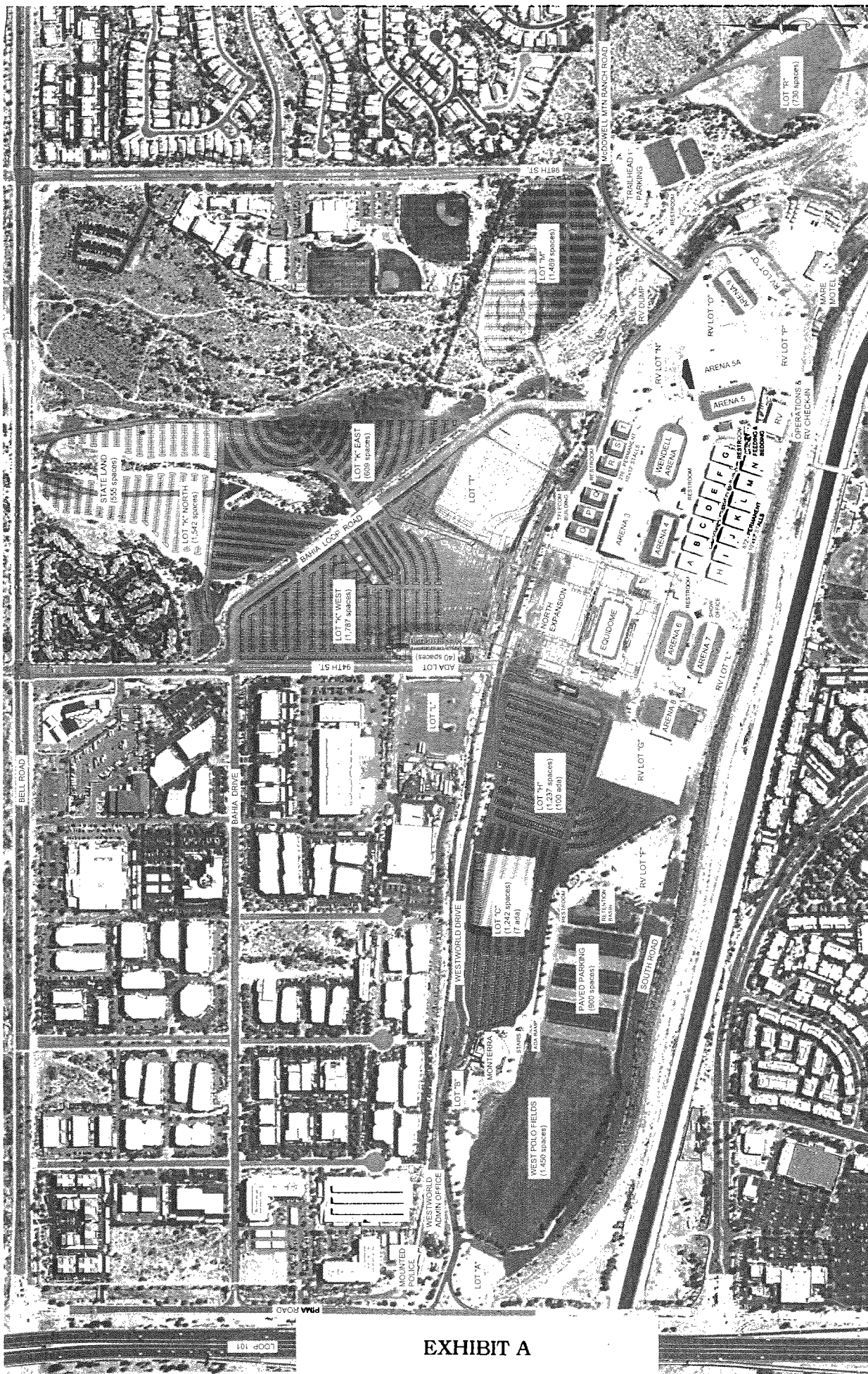
Westworld - SITE MAP 2012