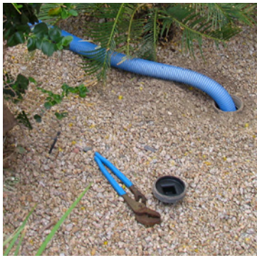
Draining your pool via the sanitary sewer cleanout.

With summer nearly upon us, it's pool maintenance time! Draining and backwashing can help keep your pool summer ready, but properly disposing that water is one of the most important ways you can protect the environment and respect your neighbors.