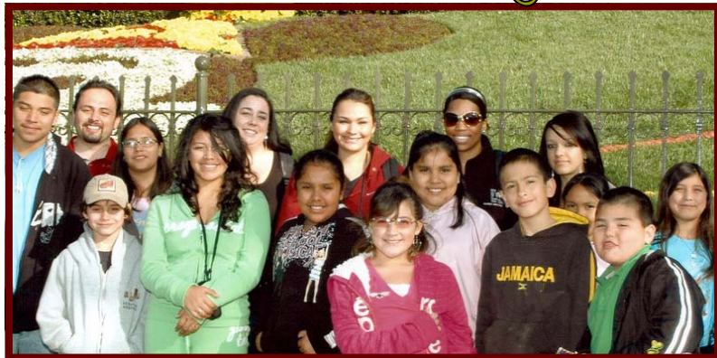
Kids from Paiute Neighborhood Center agree that Disneyland really is the "Happiest Place on Earth"

This trip was paid for through a grant from the non-profit entity, Partners for Paiute.