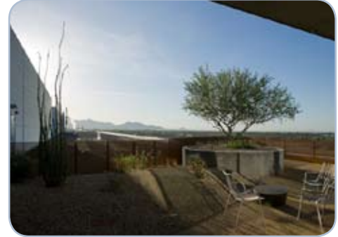
Stormwater retention can sometimes be addressed using green roof technology.