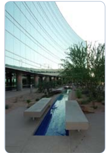
Passive cooling elements can include water features and shade.