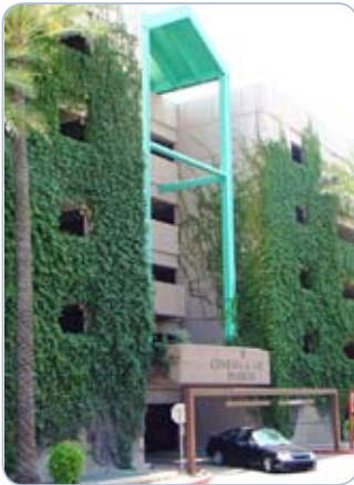
Vines on solid wall surfaces can help cool public spaces where there is little room for shade trees.