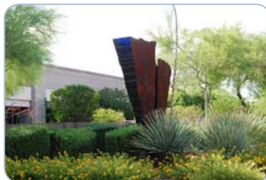
Low-water use plants in landscaping conserve water while still providing a lush landscape palette.