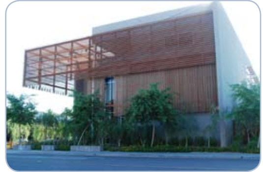
Developments can provide shade using desert plants and other passive cooling techniques.