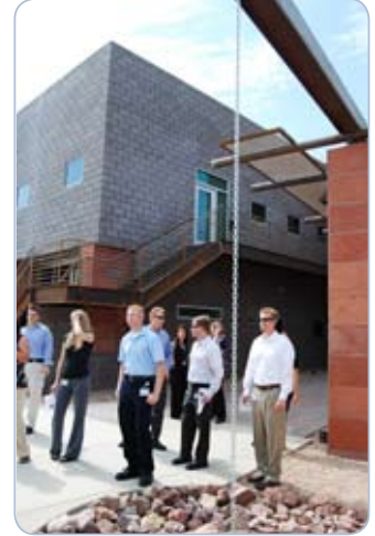
Water harvesting techniques, such as this rain chain, help to reduce water demand, a precious desert resource.