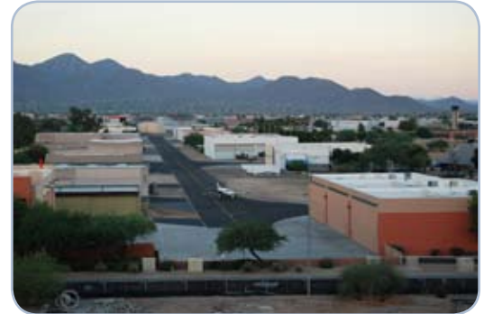
A unique aspect of the Greater Airpark is private property access to taxilanes, also known as “through the fence operations”.