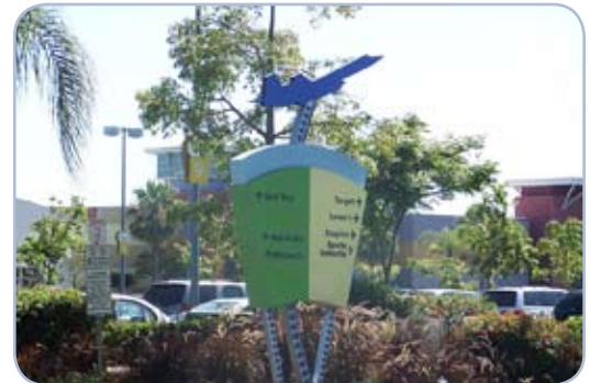
Signs and art which celebrate aviation could promote a unified identity to the area.