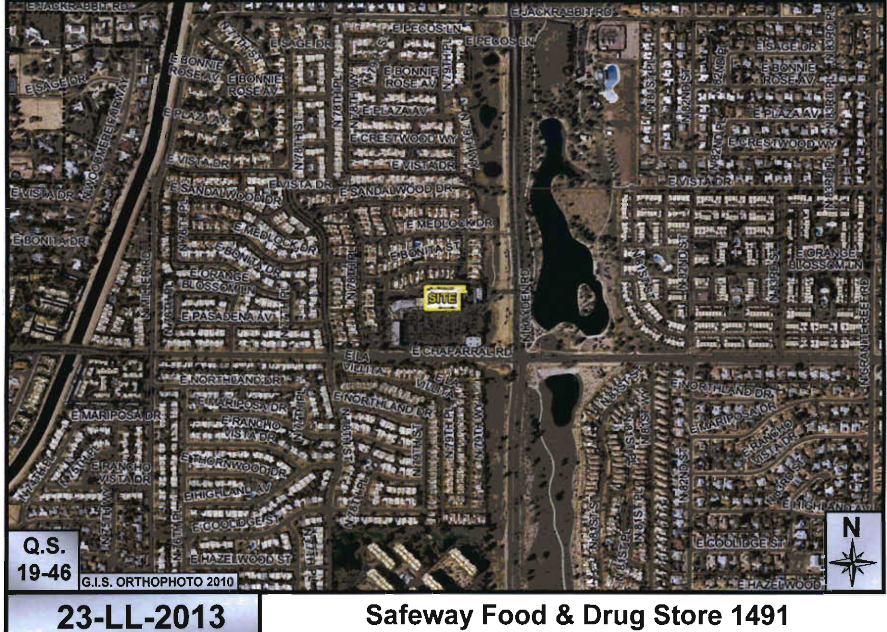
Safeway Food & Drug Store 1491