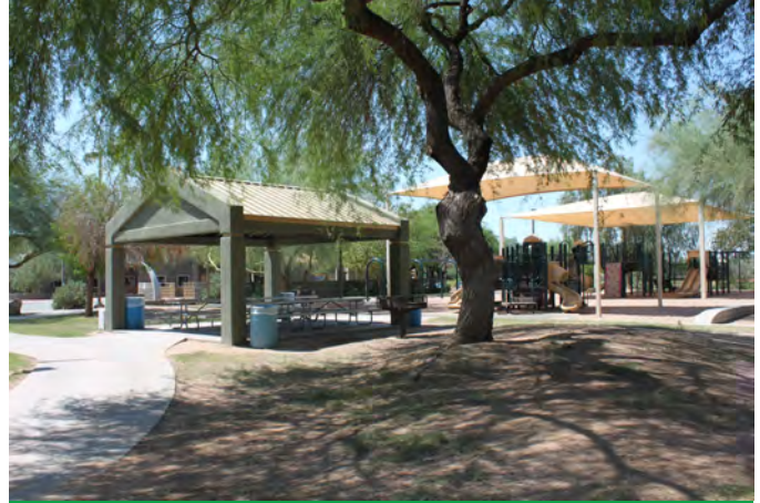
SMALL RAMADA #2