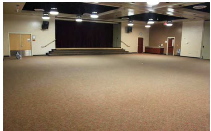
MULTI-PURPOSE ROOM A & B