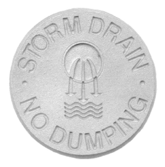
Storm Drains lead to many of our parks and lakes. Please don't litter or dump anything in our drainage system.