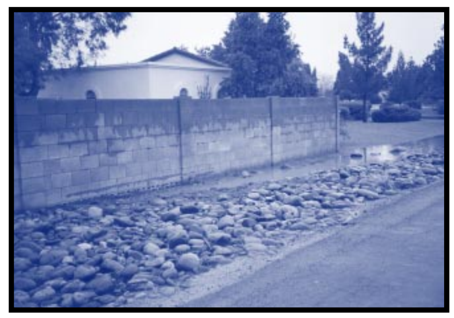
Undersized wall openings clogged easily, and caused the flooding in the photo on the cover.

The following guidelines are written in accordance with the City's Floodplain and Stormwater Ordinance. The guidelines are general in nature and may not fit all situations. If you have an unusual problem or have a specific question please contact the City's Stormwater Management staff at 480-312-7696.