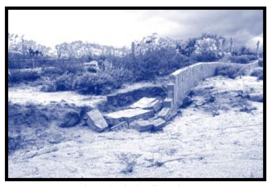
Inadequately sized wall opening.

If possible, avoid or replace weep holes or decorative block drains with a clear opening per City standard details. Weep holes and decorative block openings are generally so small they easily catch debris and clog, causing water to pond or divert (see photo p.1). This can result in backyard, pools, and houses being flooded and walls being undermined and knocked over.