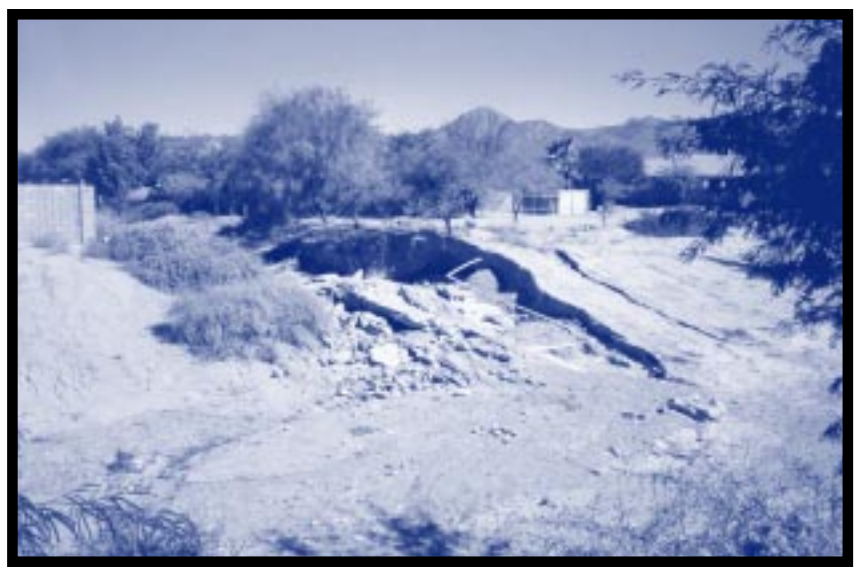
Severe erosion in an improperly lined channel.

Roofs can generate an enormous amount of runoff. When the runoff is concentrated onto small flat areas of the yard, where runoff cannot flow away from the house quickly enough, ponding or flooding of an entryway or back patio can occur. Possible solutions include grading, relandscaping, enlarging wall openings, and/or removing obstructions to flow. All of these are designed to allow water to flow away from the house as quickly as it is running off the roof. Installing rain gutters on key sections of the roof, to collect and convey runoff to a safe location, is another possible solution, and in some cases may be the only practical solution.