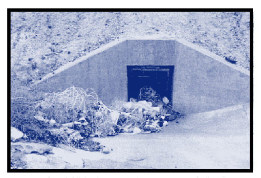
Trash and debris clog the drainage system reducing the flow of water and polluting our parks, streams, and lakes.