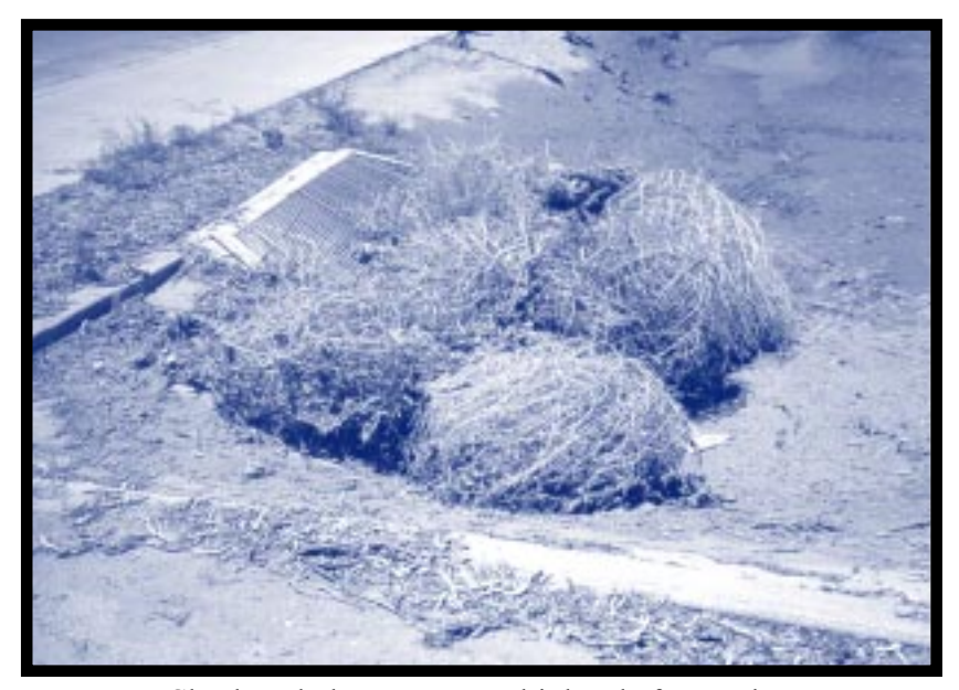
Check and clean grates and inlets before and during each rainy season (May and October).

For an individual property owner, maintenance responsibilities on a wash running through your property consist mainly of keeping it clean. This means free of trash, debris and sediment; clear of overgrown, choking or clogging vegetation; free of obstructions or structures. The purpose is to maintain the free flow of water and not impede or reduce the water carrying capacity of the wash or channel. Washes must not be filled in, plugged, blocked, diverted or altered in any way.