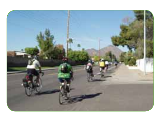
Mobility option: bicycling.

Promote both internal and external connectivity between mobility modes to create an integrated transportation system for the benefit of Southern Scottsdale.