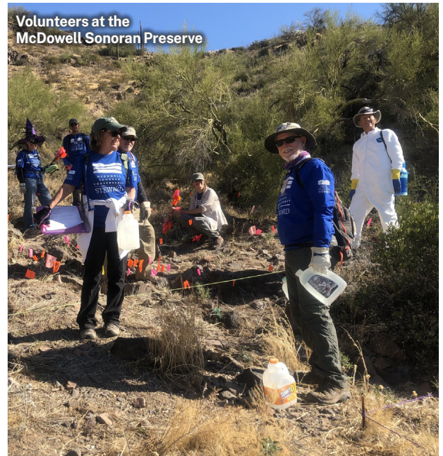
Volunteers at the McDowell Sonoran Preserve