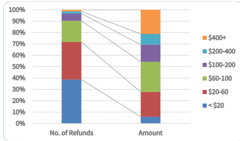
Figure 2. FY 2017/18 ActiveNet Refunds