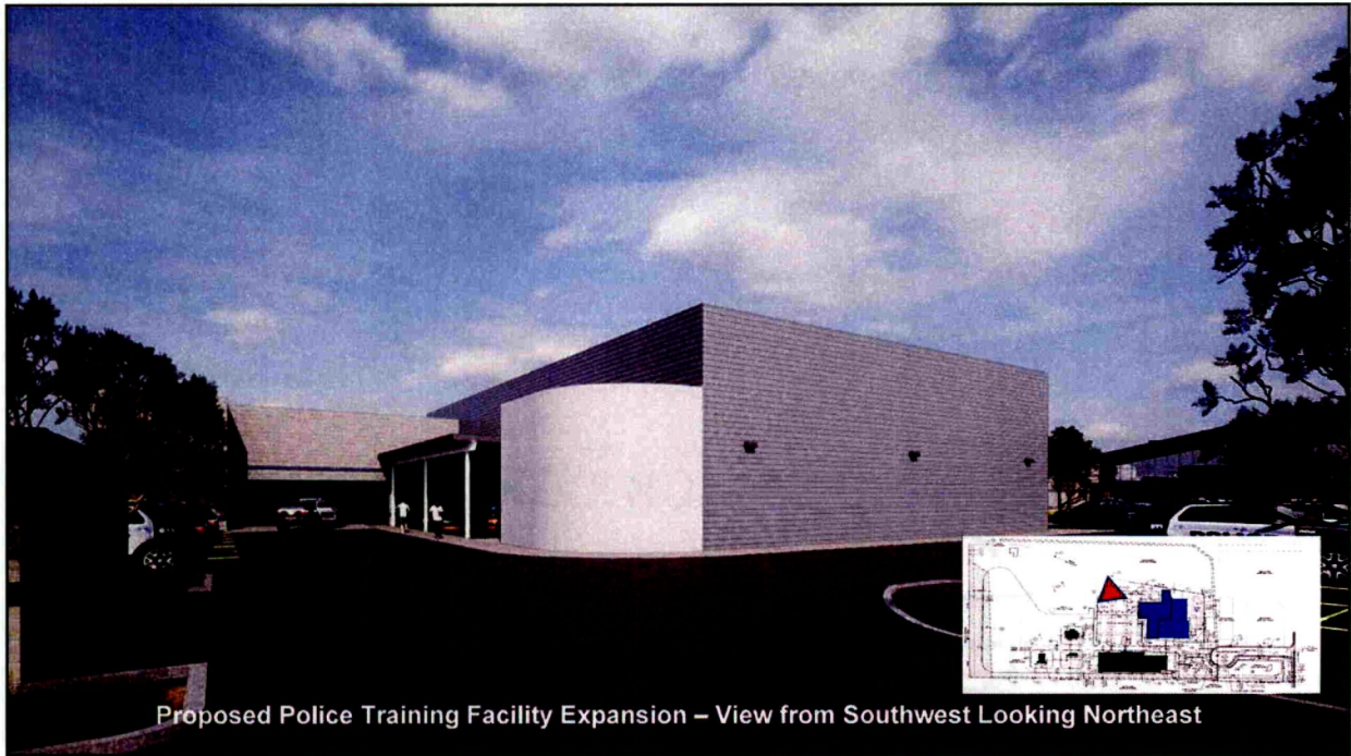
Proposed Police Training Facility Expansion – View from Southwest Looking Northeast