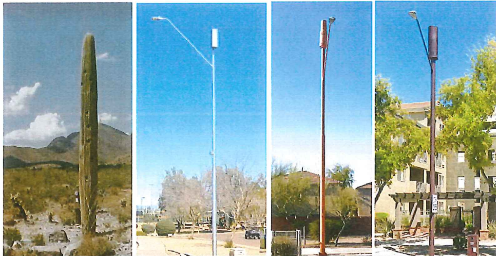
Examples of Built Small Wireless Facilities in Right-of-Way