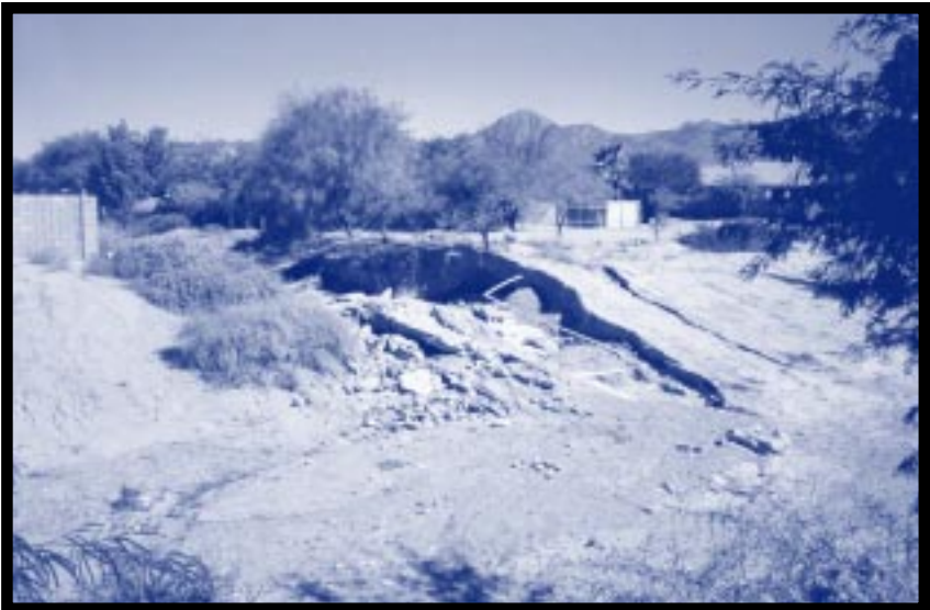
Severe erosion in an improperly lined channel.

Roofs can generate an enormous amount of runoff. When the runoff is concentrated onto small flat areas of the yard, where runoff cannot flow away from the house quickly enough, ponding or flooding of an entryway or back patio can occur. Possible solutions include grading, relandscaping, enlarging wall openings, and/or removing obstructions to flow. All of these are designed to allow water to flow away from the house as quickly as it is running off the roof. Installing rain gutters on key sections of the roof, to collect and convey runoff to a safe location, is another possible solution, and in some cases may be the only practical solution.