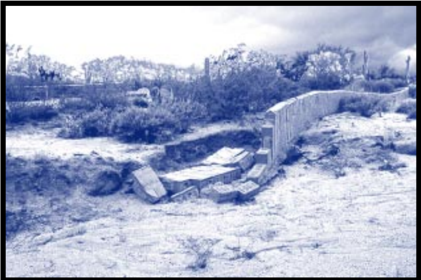
Inadequately sized wall opening.

If possible, avoid or replace weep holes or decorative block drains with a clear opening per City standard details. Weep holes and decorative block openings are generally so small they easily catch debris and clog, causing water to pond or divert (see photo p.1). This can result in backyard, pools, and houses being flooded and walls being undermined and knocked over.