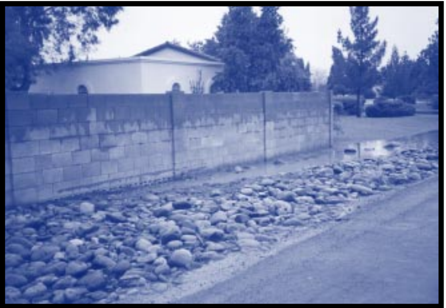
Undersized wall openings clogged easily, and caused the flooding in the photo on the cover.

The following guidelines are written in accordance with the City's Floodplain and Stormwater Ordinance. The guidelines are general in nature and may not fit all situations. If you have an unusual problem or have a specific question please contact the City's Stormwater Management staff at 480-312-7696.