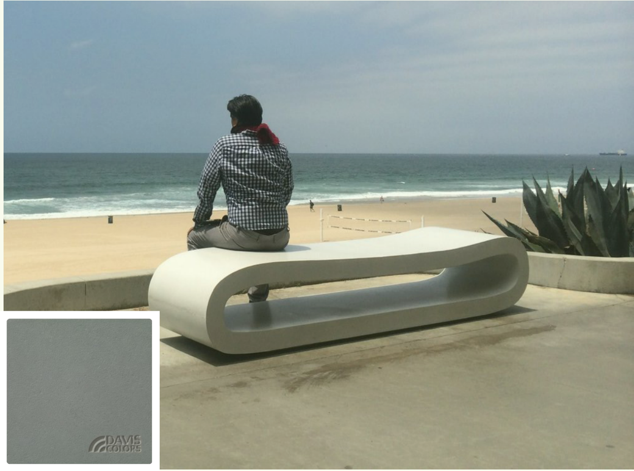
CONCEPT IMAGE (IN PROGRESS)