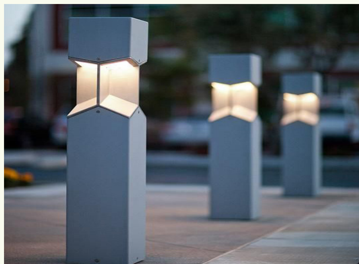
CONCEPT IMAGE (IN PROGRESS)