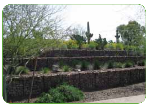
Low-water use plant materials along a public trail.

Rethink the roles and functions of urban service alleyways as viable paths and open space connectivity opportunities for Southern Scottsdale residents.