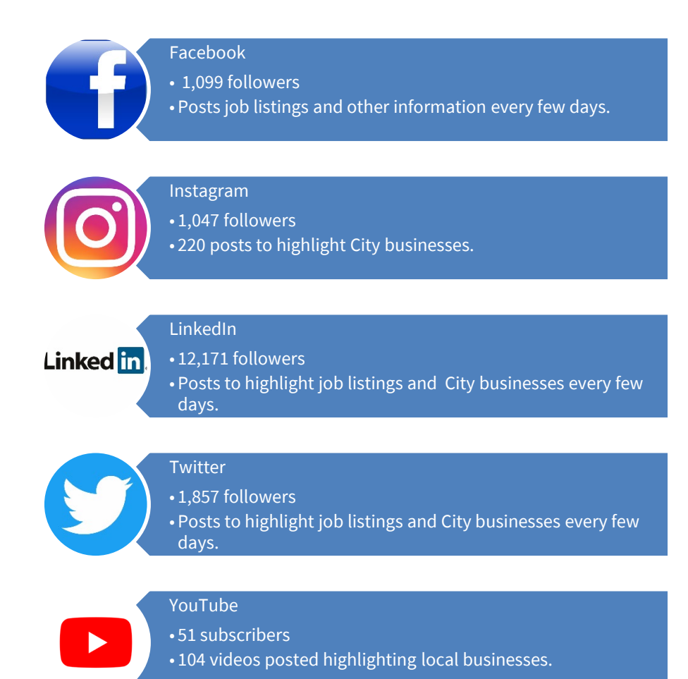
Figure 3. Economic Development Social Media Accounts