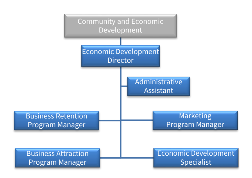
Figure 2. Economic Development Organization Chart

director, who is a Certified Economic Developer, manages 5 department staff assigned to specific service areas, including business retention, marketing, and business attraction. <sup>1</sup>