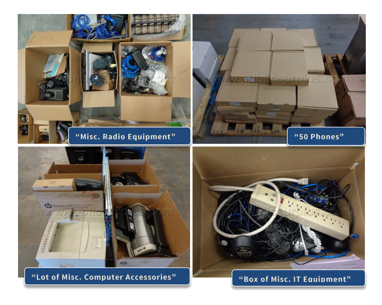
Figure 7. Examples of Auction Lot Photos