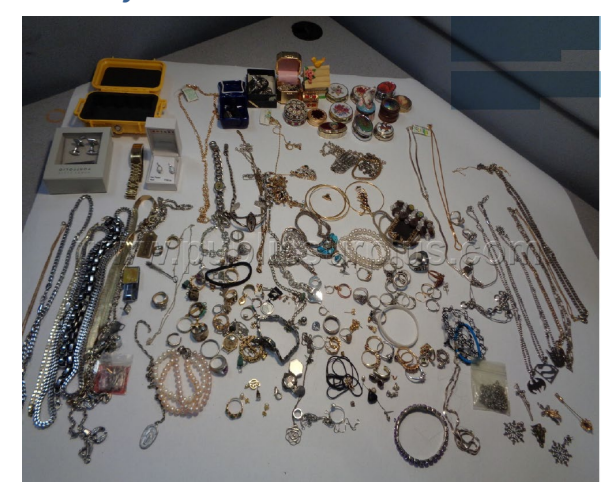
Figure 4. Example Photo of Bundled Jewelry Auction