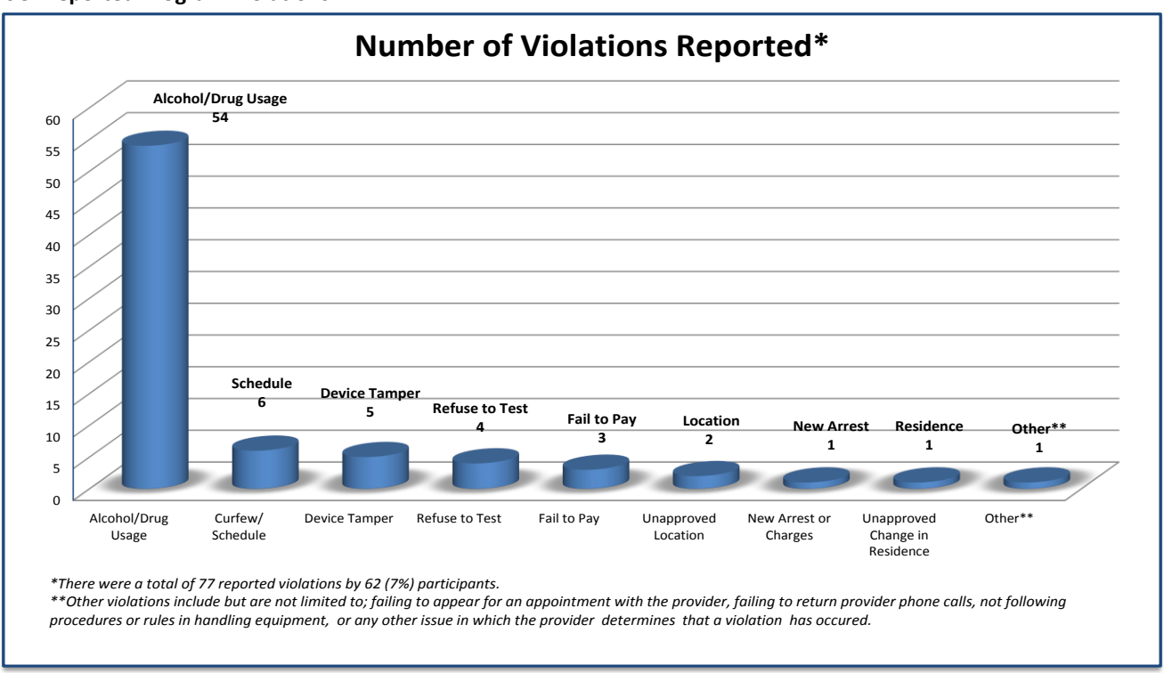
Metric 5: Reported Program Violations