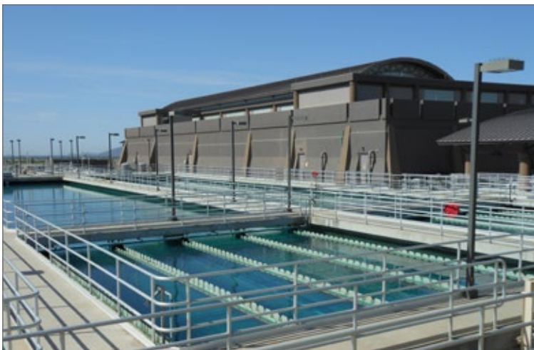
Scottsdale's CAP Water Treatment Plant

Besides these two main surface water sources, your drinking water may also come from aquifers deep below ground. The water is pumped from the ground through one of the city's 24 active wells and then disinfected prior to entering the drinking water distribution system. The water from these wells may receive other forms of treatment prior to disinfection and distribution to you. Scottsdale also uses underground aquifers to store surface water, so some groundwater was actually surface water at one time.