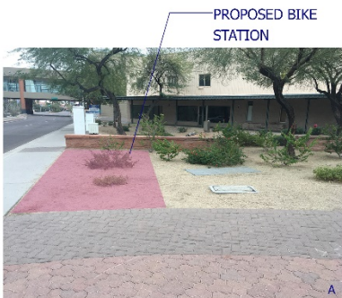
SEE (A) PERSPECTIVE: EXISTING SITE PHOTO - LOOKING SOUTHEAST