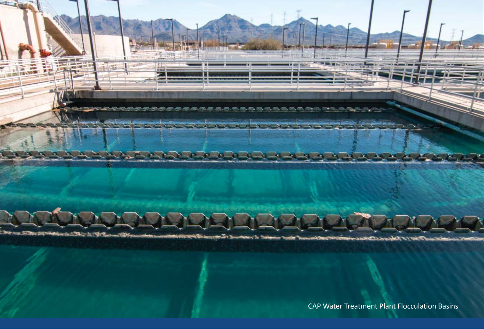
CAP Water Treatment Plant Flocculation Basins