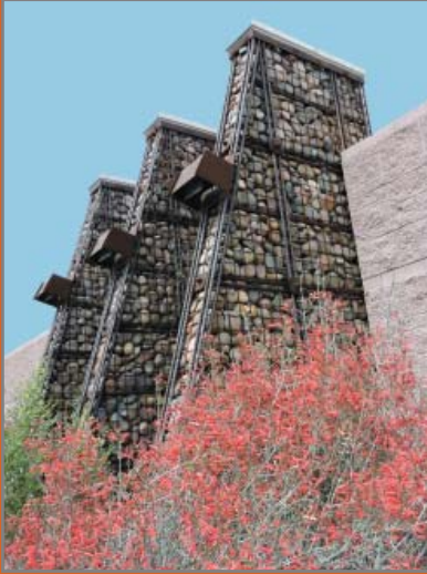
Artistic wall gabions help the Chaparral WTP blend into the surrounding landscape of the Scottsdale Xeriscape Garden.